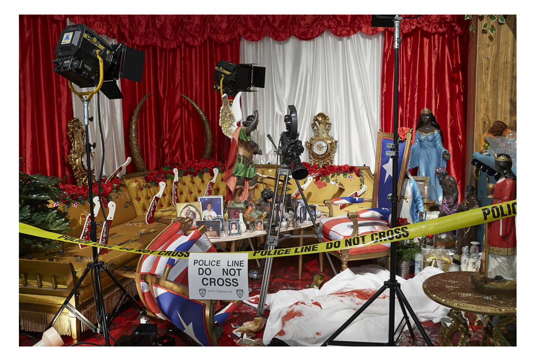
2. Pepón Osorio. Scene of the Crime (Whose Crime?) (1993) Mixed Media Installation. The Bronx Museum of the Arts Collection.

Hence, the political intent intrinsic to the use of kitsch takes on multiple implications. Exploiting that maxim of «more is more, and more is better» within the minimalist space of the contemporary art museum, Osorio directly problematized the normative opposition between high and low culture, challenging what is considered acceptable for the museum and what is not. Osorio introduced into his installation objects that diverged from the exhibition logic inherent in the artistic discourse - most evident when we take into account the prominence of the minimalist movement in American artistic modernity. The inclination towards a kitsch language was the response of Osorio's interest in maximizing subaltern elements within all the layers of his artistic proposal. For the artist, these objects would perform as a metaphor of the social classes and groups traditionally excluded from the museum, destabilizing the hegemonic discourse of contemporary art and calling into question the conventional systems of visibility that operate within the institutional realm, since «[museums] divide the field of material culture into legitimate culture and illegitimate culture - or rather, nonculture, to the extent that the illegitimate is de-